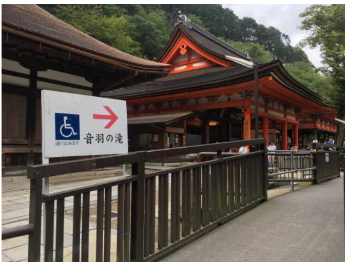
Handicap accessible mobility ramp at a tourist attraction.

I noticed that Japan has provided the most accommodations for the visually impaired. A notable accommodation for people with visual impairments is yellow tactile paving on sidewalks and platforms which serve as guiding paths. These are called Tactile Ground Surface Indicators (TGSI). These raised lines and bumps guide visually impaired people safely to their destinations (such as the train, bus, or elevator). Other accommodations for people with visual impairments include braille on toilet controls, ATMs, and elevators, as well as Accessible Pedestrian Signals (APS) at intersections which play a melody or chirps when the walk sign is active.