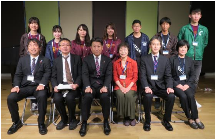
Group photo of the Kashiwa students and adult leader along with Vice Mayor, KIRA President, KIRA Vice President, and Torrance Committee Chairperson