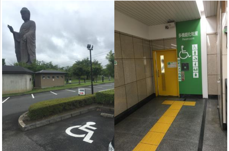
Left: Handicapped parking space