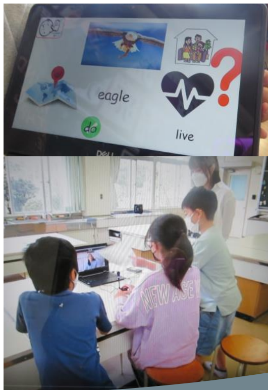
A group of three students