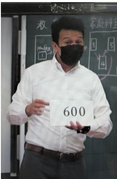
AET from the Philippines