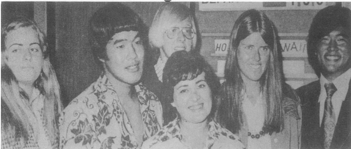
1974 Torrance Delegation

In 1974, the second Bunka Sai was on June 1st and 2nd. This time the festival was a two-day event to raise funds for this student exchange. While planning for the festival, a surprise notification from Kashiwa said that they had so many applicants that they would be sending seven students instead of the mutually agreed upon five students!