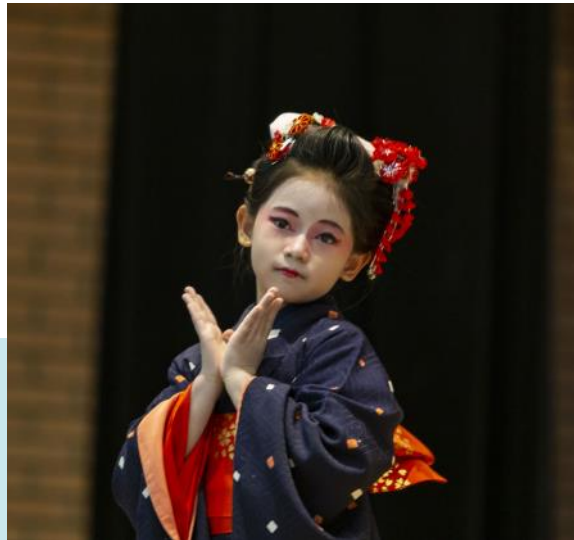
Bunka-Sai 2019

raphy, bonsai, ikebana, origami, tea ceremony and kamishibai (Old time Japanese story telling in both Japanese and English). Bonsai and ikebana will not only be on display all weekend, but will also demonstrate how you too can create your own beautiful displays. The onstage Japanese entertainment will enlighten your senses. Taiko drum performances have been expanded, opening the festival at 11 am and again at 4 pm both days. The drums are magical and will get your blood and your feet moving. The performers seem to be dancing to their own music, it is as much of a visual experience as an audio one.