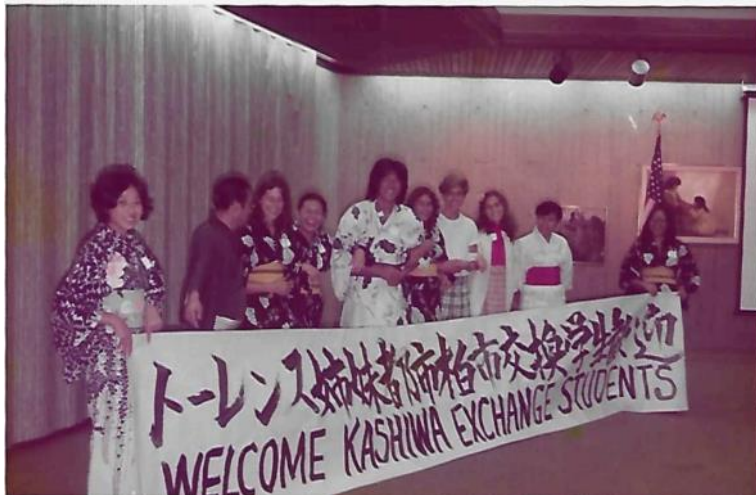
1975 Exchange Students