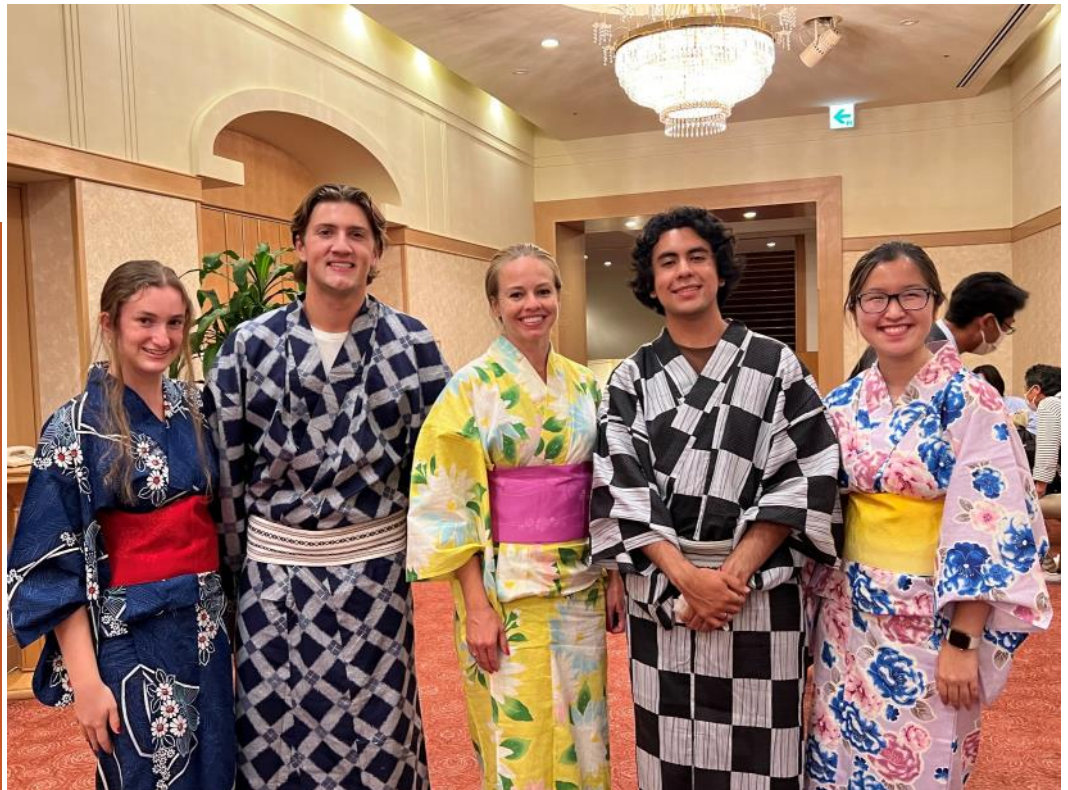
2022 TSCA Delegation

Please send an email to tscanewsletter@gmail.com