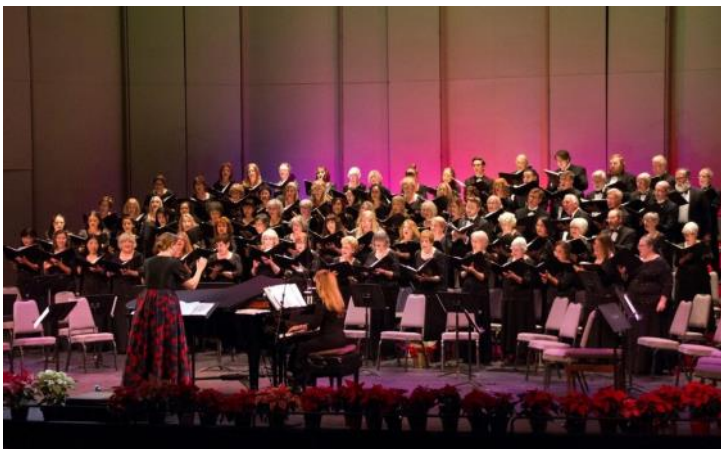
Torrance Civic Chorale