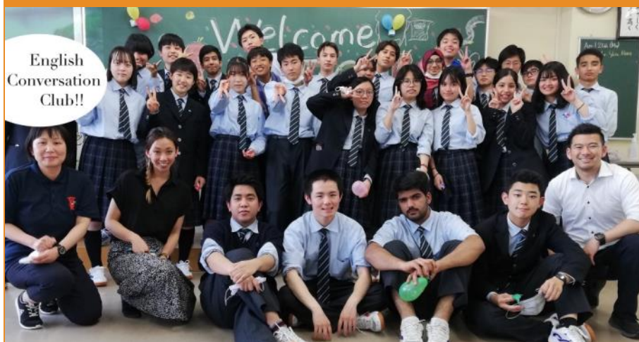
English Conversation Club!!