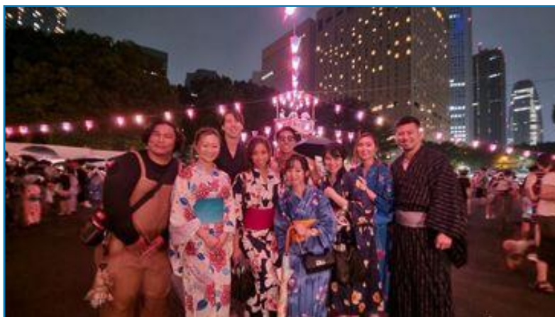
At a magical Bon Odori summer festival

more. I started my own English course and called it "Deekaiwa." I finally pursued what I have been putting off for 10 years, which was to get my yoga teaching certification. I learned to drive on the opposite side of the street and got my Japanese license after a highly rigorous exam. I got engaged to the love of my life and I found the most passionate, funny, supportive