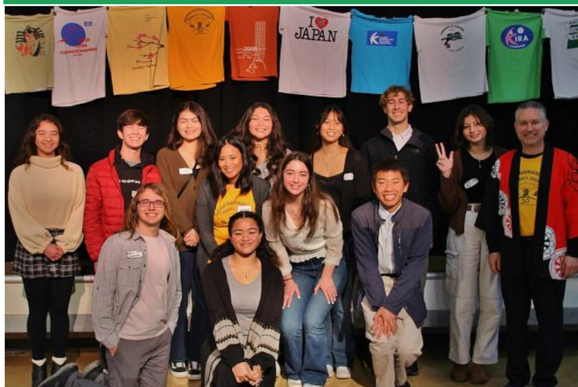
The 11 Student Cultural Exchange applicants (with Committee members) introduced themselves at the Alumni Reunion.