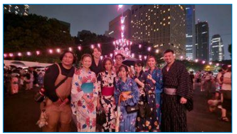
At a magical Bon Odori summer festival

more. I started my own English course and called it "Deekaiwa." I finally pursued what I have been putting off for 10 years, which was to get my yoga teaching certification. I learned to drive on the opposite side of the street and got my Japanese license after a highly rigorous exam. I got engaged to the love of my life and I found the most passionate, funny, supportive