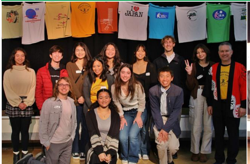
The 11 Student Cultural Exchange applicants (with Committee members) introduced themselves at the Alumni Reunion.