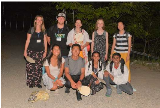
2018 Torrance Students

It is a pity that the firefly population in Japan has been declining due to habitat loss, pollution, and artificial light. Efforts are being made to conserve firefly habitats and to raise awareness about the importance of preserving these magical insects for future generations to enjoy.