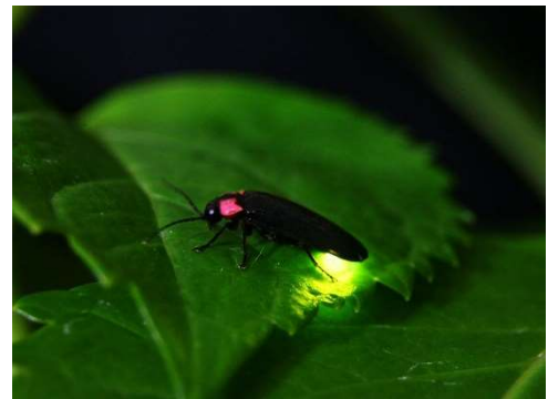
Fireflies emit light from their lower abdomens