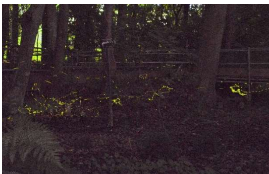
Many fireflies fly around in the dark