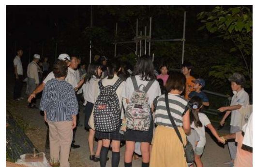
Host families joined the firefly viewing