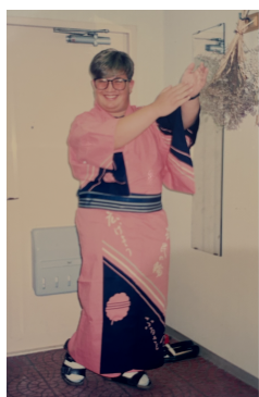
1993 - Kashiwa Odori